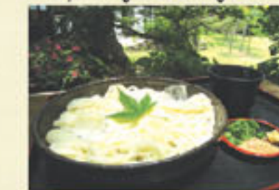
Noko Udon, local specialty