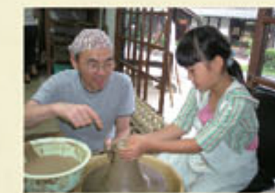
Pottery Making and Painting Workshop